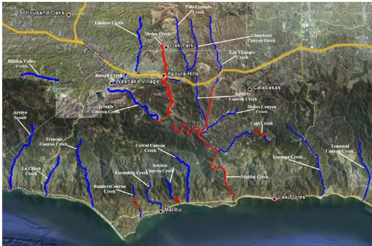
Figure 7. Surveyed Streams Showing Presence/Absence of NZMS. Red lines indicate streams that are infested with NZMS as of April 2009.

Map taken from Abramson, M, J. Topel, and H. Burdick 2009. New Zealand Mudsnaail Surveys July 2006-April 2009, Santa Monica Mountains . Santa Monica Bay Restoration Commission, Santa Monica Baykeeper. 79 pps. Available at URL below.