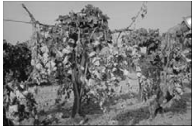
Figure 32.3 'Thompson Seedless' fruiting canes, seven days after cane severing, with the fruit clusters still attached.

Cane severing does reduce fruit production in fol-