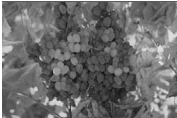
Figure 32.8 Green berries are still present on these shaded 'Thompson Seedless' clusters even after 8 weeks of drying on the vine.

'Thompson Seedless' grapes, if cane-cut at maturity, do not completely and consistently dry to raisins on the vine in the Fresno area. They do dry completely in the desert areas of Arizona and in the Coachella Valley of California. Canes cut at fruit maturity in early July of 1985 at Thermal, California, dried to well below 14 percent moisture on the vine by September 1. In the Bakersfield area fruit maturity is earlier than at Fresno, and the mean temperature is higher in the months of