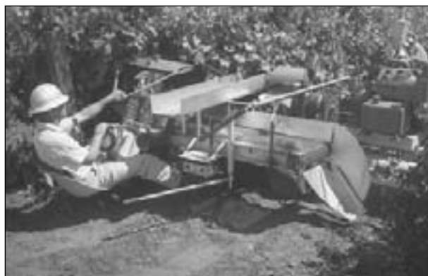
Figure 32.1 UC Davis cutterbar harvester for raisin grapes.

The harvesting machine was commonly known as the cutterbar harvester , so named for the unguarded double-sickle cutter used to sever the stems. The harvester's efficiency at detaching the fruit depended on the position of the clusters hanging beneath the trellis wires. In order to achieve the proper position for machine harvest, the shoots had to be positioned by hand and the clusters manipulated by hand in late spring and early summer, respectively. The harvest efficiency was also a function of the cluster stem length and therefore of grape variety. Harvest trials were conducted beginning in 1955, and the machine was improved each year through 1963. A towed machine (Figure 32.1) with an operator seated behind the cutter and beneath the trellis was first tested in 1961. Over the years, several grape varieties were tested, including 'Thompson Seedless,' 'Malaga,' and 'Black Monukka' in plots at Davis, Madera, Fresno, Delano, and Arvin. Under the best