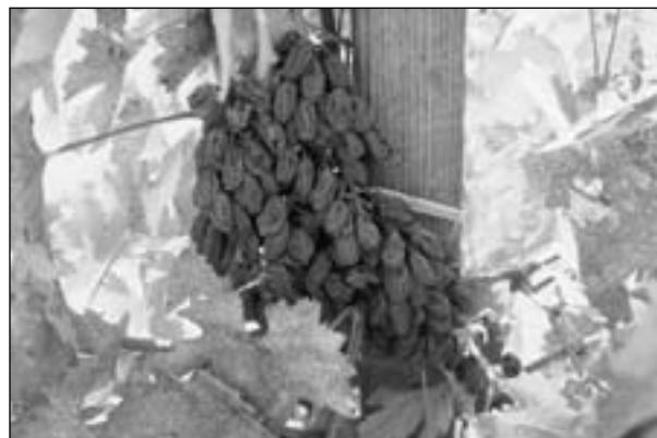
Figure 32.11 In the future, early maturing grape varieties that dry naturally on the vine may permit mechanized vine pruning as well as machine harvesting without severing the canes.

DOV fruit with artificial dehydration or sun drying as a finishing operation. In the latter case, fruit production from shoots behind the point where the canes are severed continues to pose a serious problem, both for 'Thompson Seedless' and for 'Black Corinth' varieties. A practical, long-term solution to this problem that is not detrimental to yield would greatly enhance the economic viability of DOV culture and would be of immense benefit to the raisin industry.