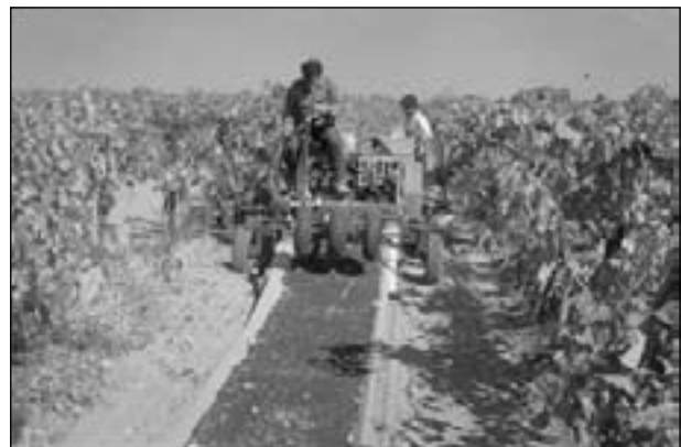
Figure 32.5 The pickup machine tensions the paper tray and sweeps the raisins off as the machine moves along the row.

lowing years. By paying careful attention to where you cut the canes, you can minimize the negative effects of cane severing. It remains to be shown that these effects can be eliminated completely, even with special trellising. When crews use power shears, cane severing for 1 acre requires 4 to 5 hours of labor. Severing the canes is more labor intensive than the machine harvesting operation itself. Continuous paper tray costs are higher for machine harvesting than for hand harvesting