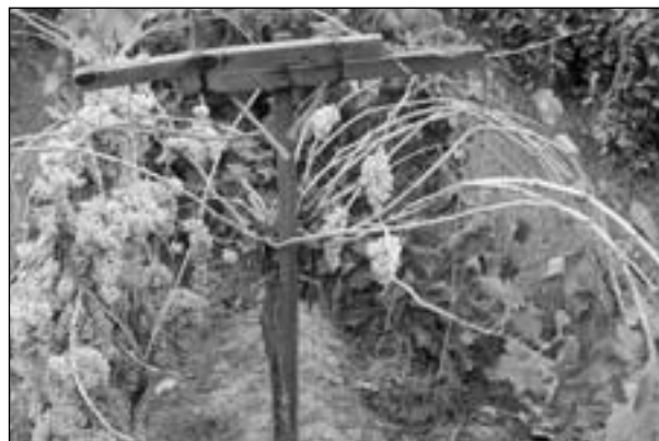
Figure 32.10 Alternating Duplex trained vine. Clusters on the right are in the fruiting cane replacement zone and will not be affected when the fruiting canes on the left are severed. The presence of this fruit complicates the harvest operation.

At present, practical alternatives to hand-harvested, sun-dried 'Thompson Seedless' raisin production include shake harvesting from severed canes onto continuous trays (with the obvious disadvantages posed by inclement weather) and shake harvesting of partial