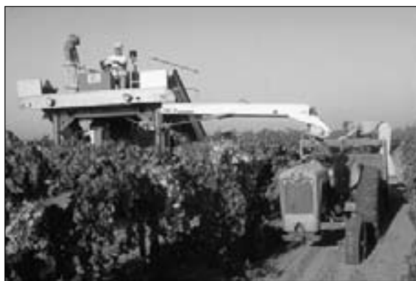
Figure 32.9 Machine harvest of DOV 'Zante Currant' raisins on the Glen Wilkins ranch, using an Up-Right Harvesters machine.

August, September, and October. Although there tends to be more frequent rain south of Fresno, that should not affect DOV fruit seriously since it dries out rapidly after a rain. Because fruit there would tend to dry more completely on the vine, regions south of Fresno may offer some advantages for 'Thompson Seedless' DOV production.