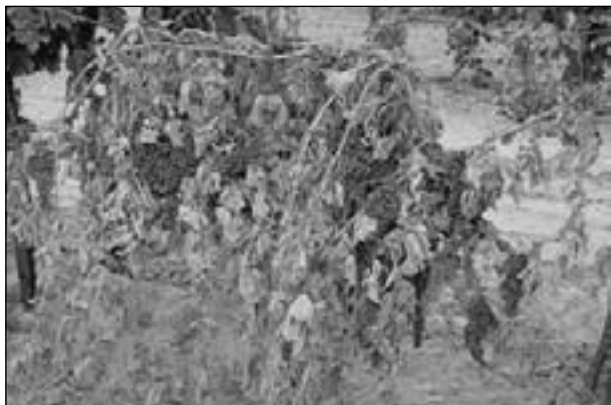
Figure 32.7 'Thompson Seedless' on severed canes after 6 weeks of drying on the vine.

paper tray after several weeks of vine drying. However, juice from the fresh berries damaged during shake-harvesting diminishes the blue color of the vine-dried fruit. Hence, the full potential for improved raisin quality is not realized with this modified harvesting system. Hiyama Farms near Fowler, California circumvents the problem of fresh fruit in the vine head region by hand-harvesting and tray-drying all of the fruit borne behind the cut canes before machine-harvesting the vine-dried fruit. While these two harvesting methods are commercially viable, the ideal of a one-pass "from-vine-to-bin" raisin harvest remains to be accomplished.