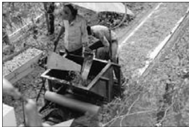
Figure 32.6 An apparatus built by raisin grower Earl Rocca for spreading machine-harvested single berries onto a continuous paper tray.

Efforts to produce dried-on-the-vine (DOV) raisins from 'Thompson Seedless' grapes commenced in 1965 and continued in 1969 and 1970 at the Kearney Agri-