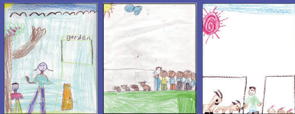
Artwork created by visiting students to Elkus Ranch.

"I really liked Elkus Ranch. My favorite part was everything!"