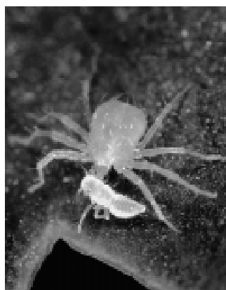
Jack Kelly Clark captured this photo of a predatory mite, Anystis agilis , attacking a grape leafhopper nymph. The mite also is commonly found in citrus.

Recently a one-on-one workshop on digital photog-