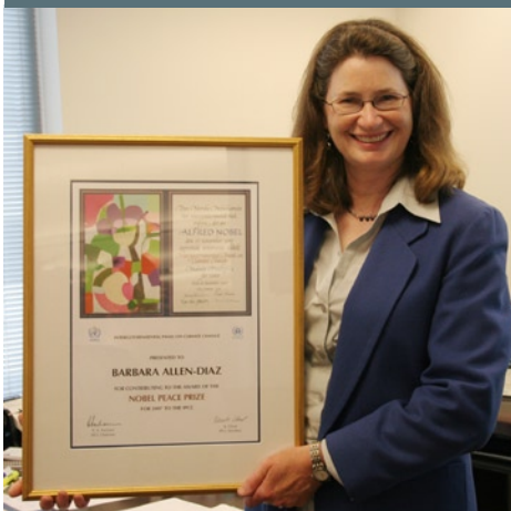
(See story on page 3)