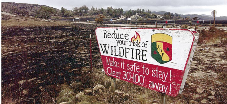
The Cedar fire burned more than 280,000 acres and killed 14 people. The Center for Fire Research and Outreach will coordinate efforts of UC and government agencies addressing wildfire.

The College of Natural Resources has established the Center for Fire Research and Outreach to coordinate fire-related research and outreach within CNR and the Berkeley campus, and among Cooperative Extension advisors and specialists and other UC campus faculty, and government agencies.