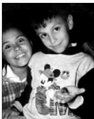
Students in Sacramento START after-school program study snails through the 4-H Youth Experiences in Science Project.

Each year since 1998, National 4-H has collected the best program impact reports from the states to highlight "the breadth, depth, diversity and impact of the nationwide 4-H program," according to the organization. In 2001, it selected one-third of the submissions