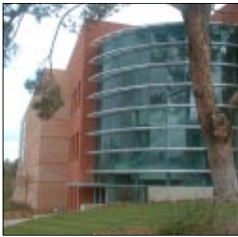
Opening ceremonies for Pest Management Building I will be held on Monday, May 6.