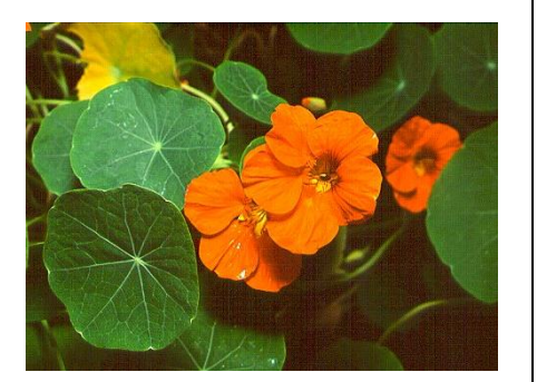
Nasturtium Tropaeolulm sp.