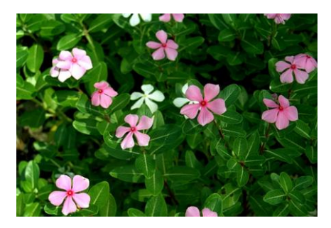
Vinca Catharanthus roseus