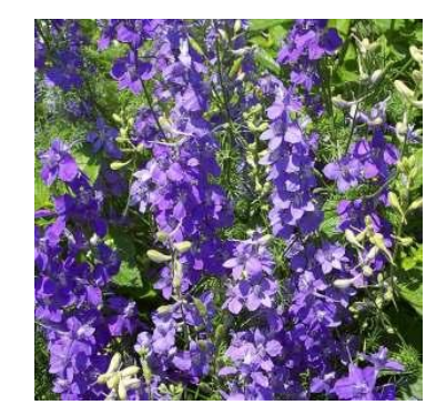
Larkspur Consolida ambigua