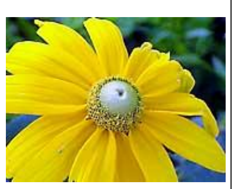
Gloriosa daisy Irish Eyes – R. hirta