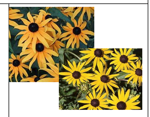
Goldsturm Black-eyed Susan Rudbeckia fulgida - perennial