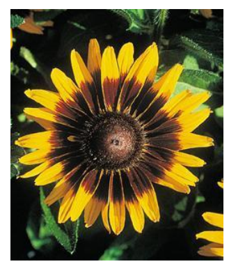
Gloriosa daisy Sonora – R. hirta