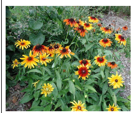
Gloriosa daisy Rustic colors- Rudbeckia hirta

Growers have developed many attractive selections of this North American wildflower, ranging from 1 to 8' tall. Rays can be single or double in gold or lemon yellow; the centers vary from dark brown to purplish-brown or green.