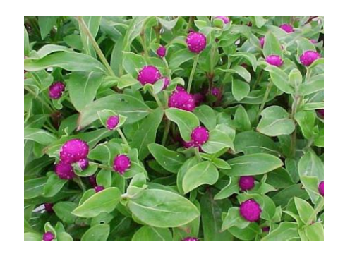
Globe amaranth Gomphrena globosa