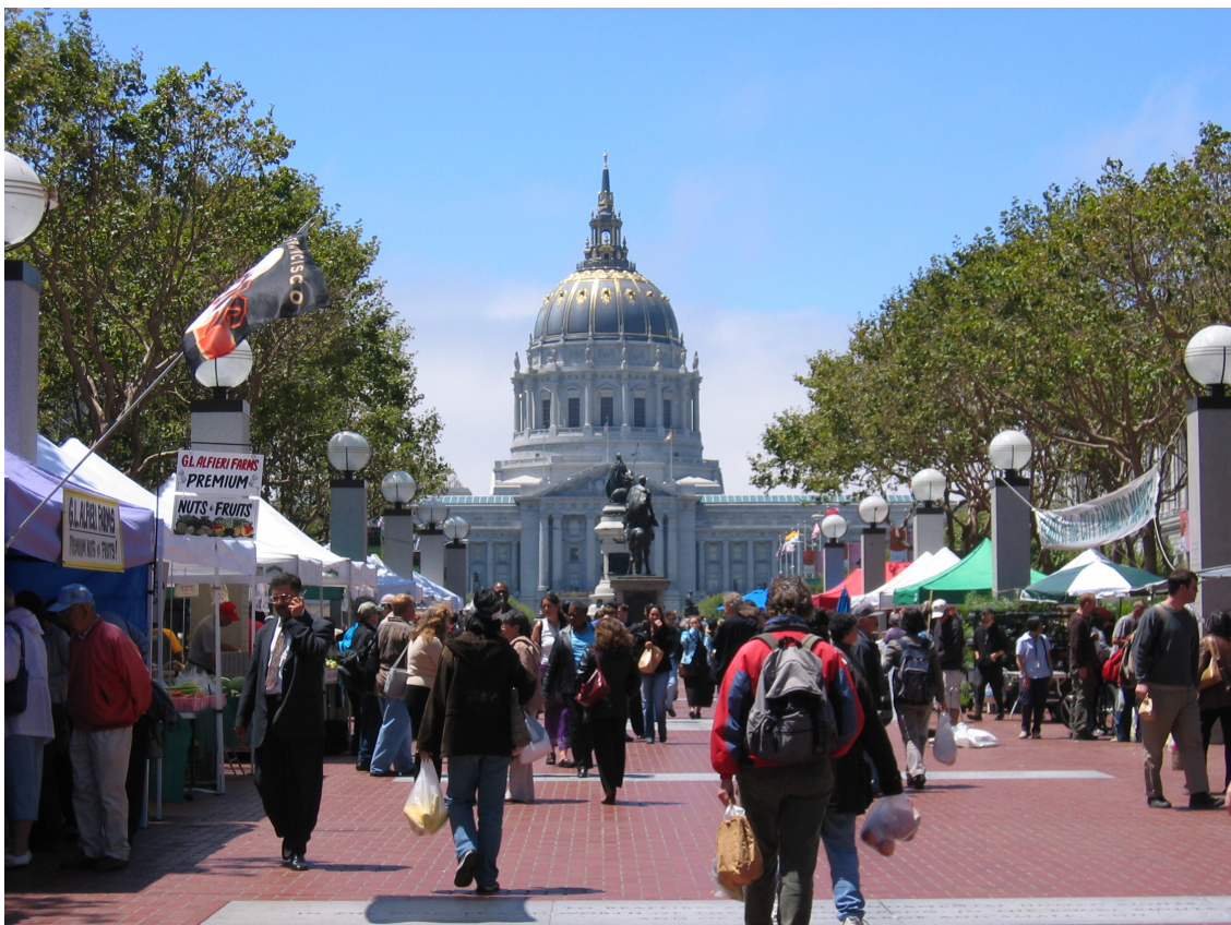
Heart of City Farmer Market