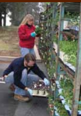
Inspecting for Glassy-winged Sharpshooter.