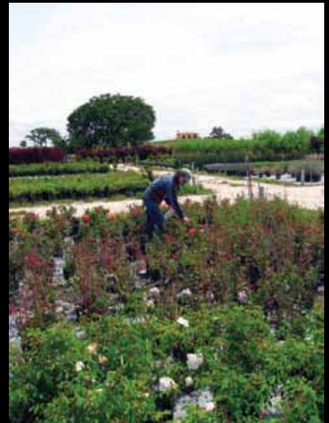
Inspection of plant material during annual nursery surveys.

Keeping agricultural pests out of the county, vigilantly looking for and dealing with pest problems as they arise, and reaching out to the public are the keys to the Ag Commissioner's successful pest prevention program, thus protecting not only the local agricultural economy, food supply, and native habitat, but also helping to preserve California's ability to feed and beautify the world.