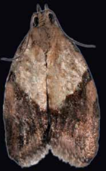
Light Brown Apple Moth

Pest detection puts the County on the offensive against newly introduced invasive pests. In 2009, Ag Department staff deployed over 2,000 specialized insect traps in urban, rural, cropland and nursery settings and performed over 26,000 periodic inspections of those traps. In addition, staff perform periodic visual surveys to detect the presence of agricultural pests that may have hitchhiked into the county on uninspected or illegally shipped plants. Continuous trapping and periodic surveys allow the Ag Commissioner's staff to find invasive pests when populations are still small and successful eradication is possible. The Light Brown Apple Moth is one such pest that was found recently in insect traps in San Luis Obispo County when populations