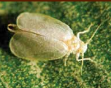
Giant Whitefly (Aleurodicus dugesii)