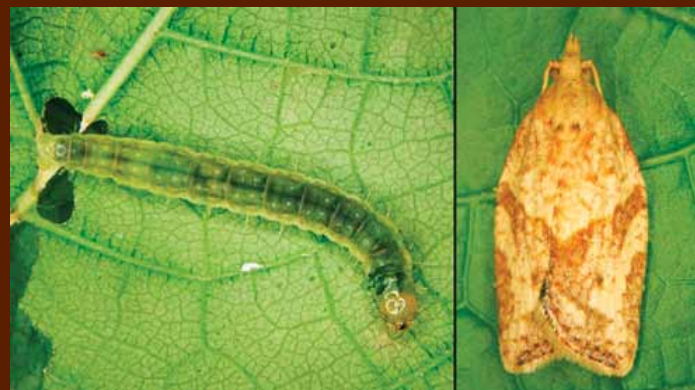
Light Brown Apple Moth (Epiphyas postvittana)

During 2009, county staff placed over 2000 insect traps throughout the county and made more than 26,000 total visits to these traps to determine if certain detrimental insects were present. The year was notable for the three insect pests captured in county-deployed traps for the first time: the Light Brown Apple Moth ( Epiphyas postvittana ), which prompted an eradication program by CDFA; the Apple Maggot Fruit Fly ( Rhagoletis pomonella ), which is under close surveillance through continued trapping; and the Spotted-Winged Drosophila ( Drosophila suzukii ), a pest the University of California is studying to develop control techniques. Other examples of pests being sought through trap monitoring include the Asian Citrus Psyllid, Red Imported Fire Ant, Glassy-winged Sharpshooter, Gypsy Moth, Japanese Beetle and a variety of exotic fruit flies. None of these pests were captured in traps in 2009. Efforts to detect detrimental pests through targeted trapping in 2009 helped to maintain the high quality of agricultural products grown in San Luis Obispo County.