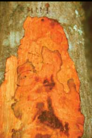
Phytophthora ramorum symptoms on oak tree.

Historically, throughout the state, most discoveries of invasive or exotic agricultural pests are linked to uninspected "backyard" plants brought into an area by uninformed and unsuspecting members of the public. According to Ag Commissioner Lilley, "most people are unaware of the regulations that apply to the transportation of plants and do not realize that serious agricultural pests may be hiding on the very plants they bring into The County."