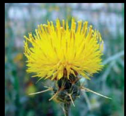
Yellow Starthistle (Centaurea solstitialis)

When developing a pest management plan, it is important to incorporate many different techniques and prioritize the areas that need to be treated. For example, the Ag Commissioner's management plan for controlling the invasive weed, yellow starthistle ( Centaurea solstitialis ), is much like fighting a wildfire. The first element of the plan is establishing a perimeter, or a "fire line," and any starthistle plants growing outside of the perimeter become the highest priority for removal. The second element is preventing yellow starthistle from spreading within the established "fire line." The final