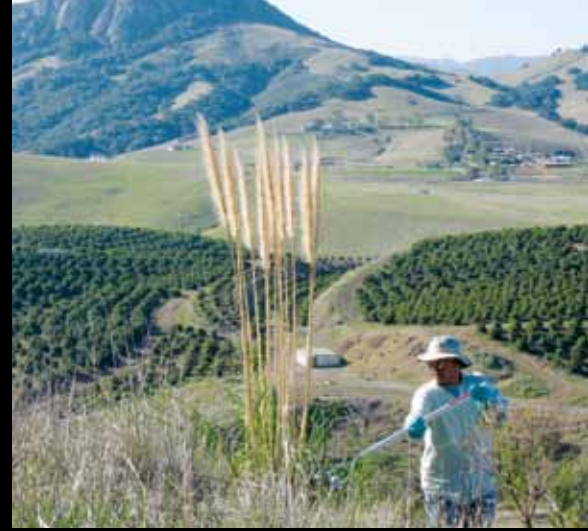
Jubata grass eradication at Cal Poly.

invasive plant native to Spain and Portugal that was discovered in only one location in San Luis Obispo County in 1998. In fact, that one local occurrence is the only place in all of North America where this plant has been discovered! In Spain and Portugal, Foxtail Restharrow is a highly aggressive invader that forms dense stands that exclude native vegetation, and has the potential to severely affect pastures, rangeland, and oak woodland areas in San Luis Obispo County. The Ag Commissioner's staff has successfully controlled the Restharrow population for eleven straight years without allowing a single plant to reach maturity and produce new seed. However, new plants continue to germinate from the long-lived seeds produced prior to 1998. The seed bank is finally nearing the end of its viability, and the infestation should disappear within the next few years.