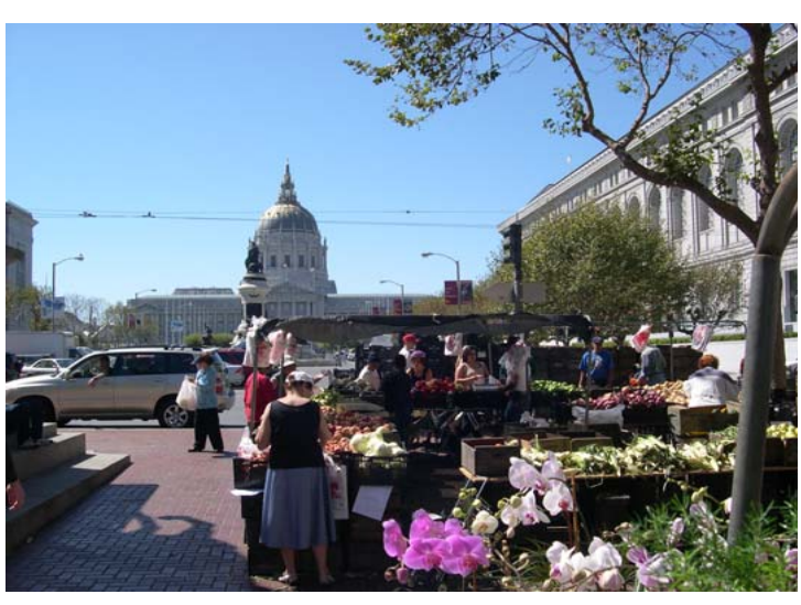
Heart of the City Farmers' Market, Market St., San Francisco