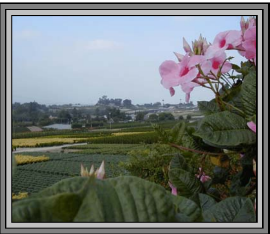
Overview of Nursery 2003