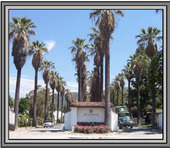
Front Entrance 2006