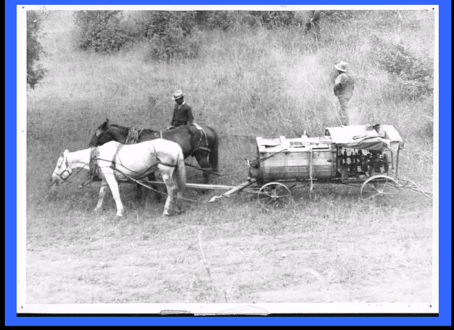
Weed Control Unknown Date