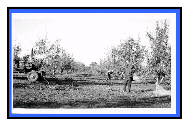
Steaming Pear Trees for Codling Moth 1938?