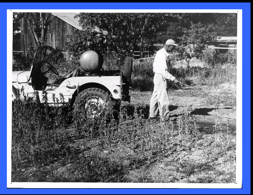
Ag. Dept. Weed Control, 1960's