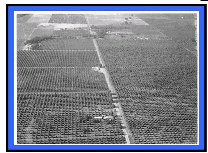
Kelseyville Pear Orchards, 1960's?