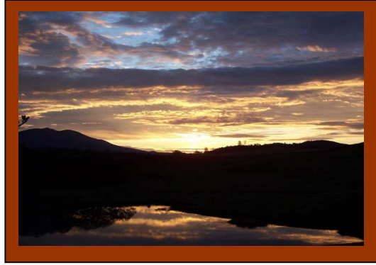
Sunrise by Konocti

JIM COMSTOCK DISTRICT 1 JEFF SMITH DISTRICT 2 DENISE RUSHING DISTRICT 3 ANTHONY FARRINGTON DISTRICT 4 ROB BROWN DISTRICT 5