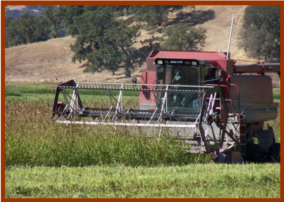
Wild Rice Harvest