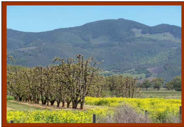
Pear Orchard in Kelseyville